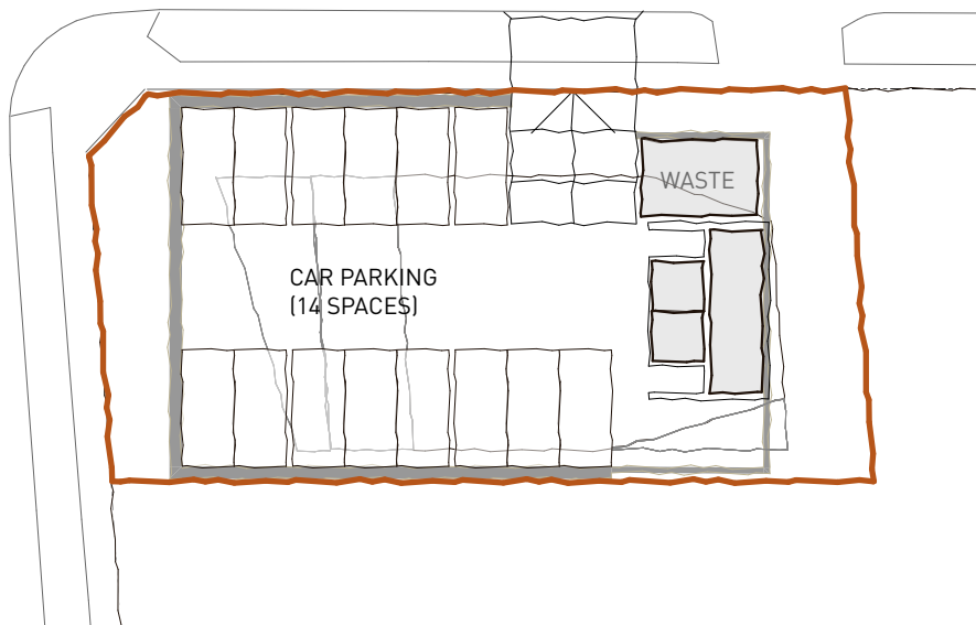
1 BASEMENT 1:400